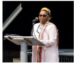
Moments from the Conference, July 2022

During the year of April 2022 – March 2023 the Steering group consisted of 7 members. Monthly video meetings took place online and face to face meetings took place in September 2022 and February 2023. Steering group members delivered moving speeches at Samphire’s AGM 2022. During the February meeting, our Media and Advocacy Lead provided the group with social media and advocacy training. Some mental coping techniques training was arranged for April 2023. Steering group terms of reference were formalised to clarify the group’s aims and direction.