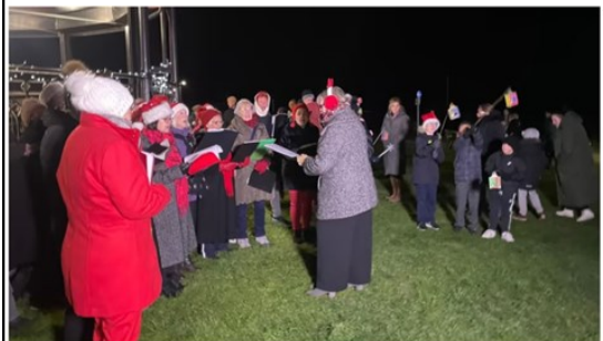
Migrant welfare group, Samphire, hosted the meeting at Walmer Green Bandstand.

MERIDIAN | DEAL | KENT | MIGRANTS | Thursday 15 December 2022 at 6:25pm