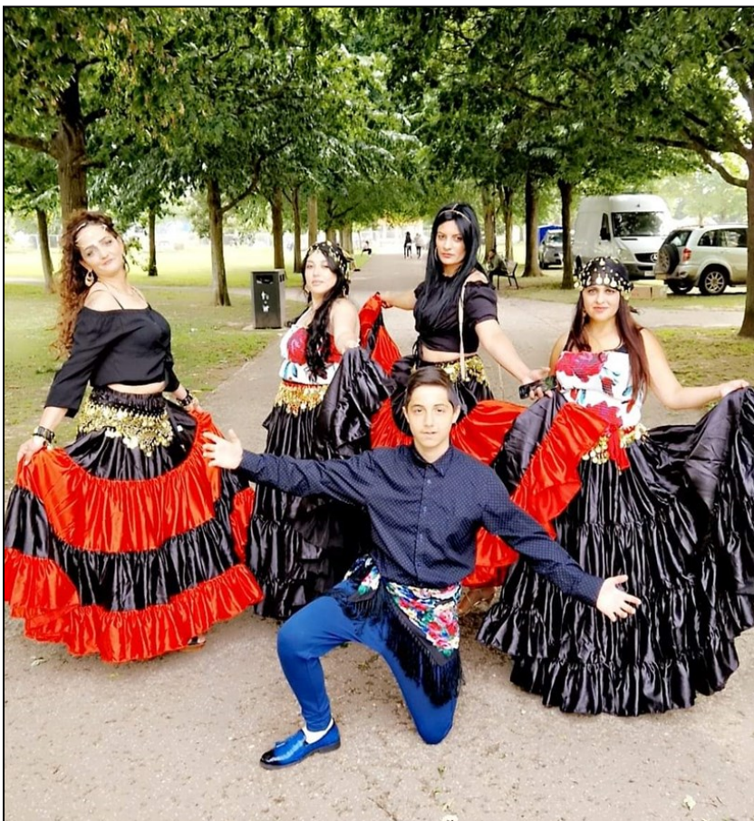
Roma dancers in traditional dress